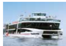
MS RheinMagie (ex MS RheinEnergie)