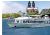
MS RheinVision (ex MS Loreley)