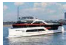
MS RheinGalaxie 3