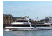
MS RheinHarmonie (ex MS Jan von Werth)